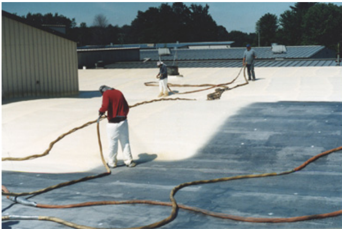
Installing Spray-Foam insulation over old Built-Up roof membrane