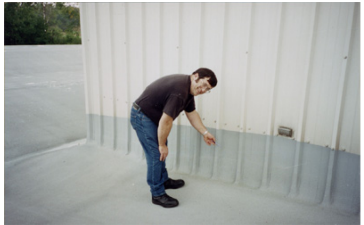
Base flashing detail with new Seamless Spray-Foam and Silicone Coating